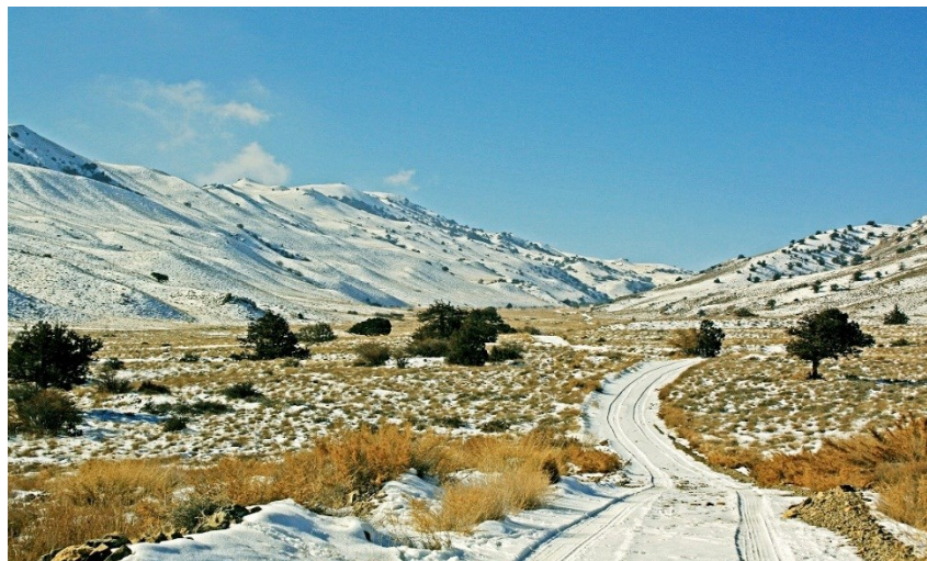
Figure 2. Almesh Valley, Golestan National Park

The park covers forested areas in the east, semi forested to bushlands in the center and semi desertic areas in the east. Natural and scenic beauty together with high biodiversity are features of the park (Figure 2).