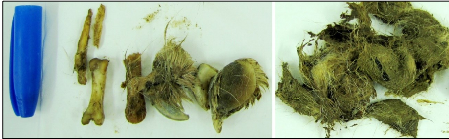
Figure 3. The prey remains of P. pardus in Golestan National Park.

protocol. The Control region of mtDNA was PCR-amplified using primers including L15995 (Taberlet et al. , 1994) and H16498 (Fumagalli et al. , 1996).